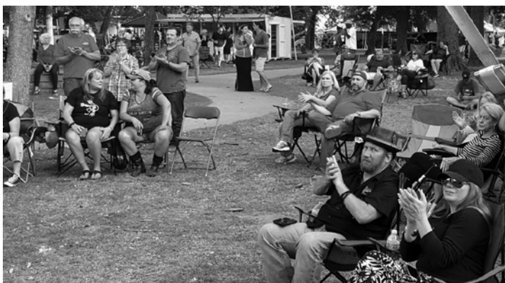
*Great food, BBQ competition, and of course, great Blues – all sponsored by the Bixby Rotary Club, May 6-7.