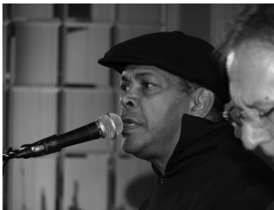
Sugar Blue, Chicago.