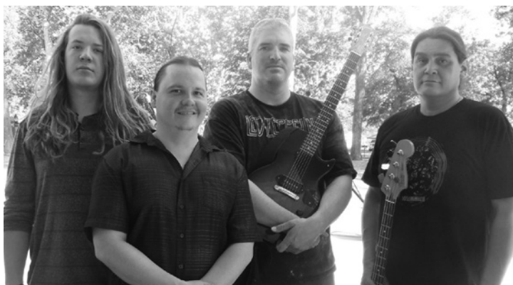
**The Vox Squadron